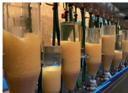
First stop in the fish hatchery hut - Reinanken (whitefish) eggs

March - April Hatched fish are released into Lake Traunsee