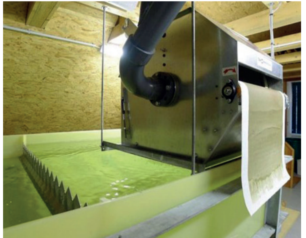
Traunsee water filter station

The fish hatchery hut, built by the Rettet den Traunsee-fisch association, went into operation in 2004. The aim is to save the native fish of Lake Traunsee, especially the Reinanke (whitefish) and the native Saibling (char). The fish are threatened by several factors: Climate as well as geological changes, industrial waste, the sharp increase in private boats on the lake and, most recently, the pumped storage power plant in Ebensee on the Sonnstein.